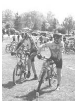
This year's "Path to a Better Heart" in Malden Park featured a new event, a duathlon — 3k run, 10k bike, 3k run.

All proceeds go to the Windsor-Essex Cardiac Wellness Centre. Funds are used to purchase new equipment and towards resources needed to provide quality care for